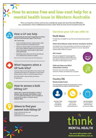
How to Access Free and Low Cost Services