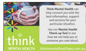
Think Mental Health Website Cards