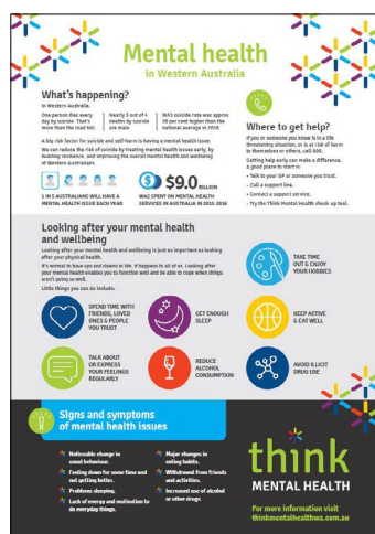
Mental Health in WA