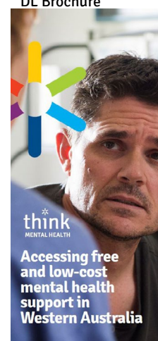
Mental Health in WA brochure