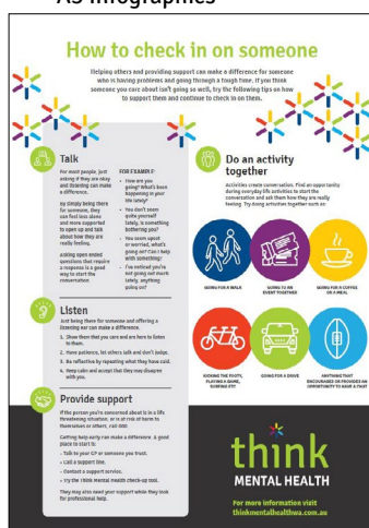
How to check on someone