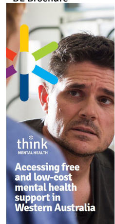
Mental Health in WA brochure