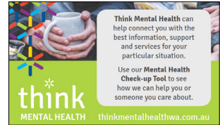
Think Mental Health Website Cards