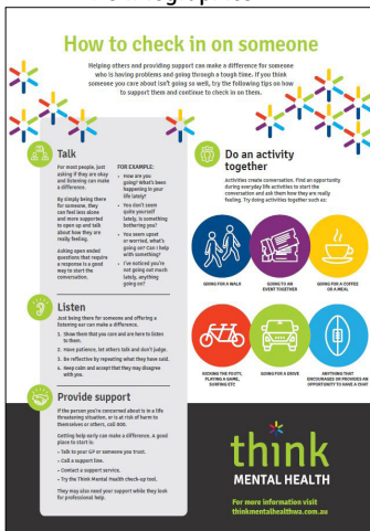
How to check on someone