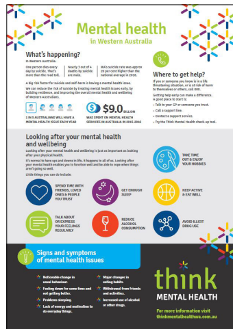
Mental Health in WA