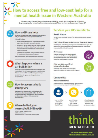
How to Access Free and Low Cost Services