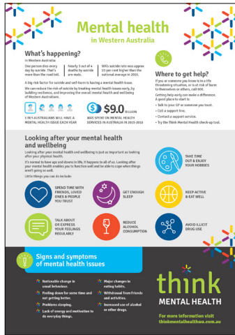
Mental Health in WA