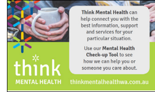
Think Mental Health Website Cards