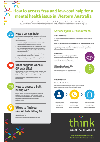
How to Access Free and Low Cost Services