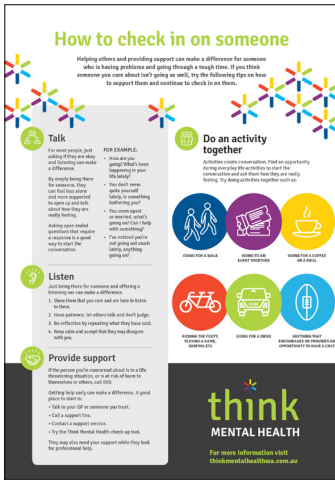
How to check on someone